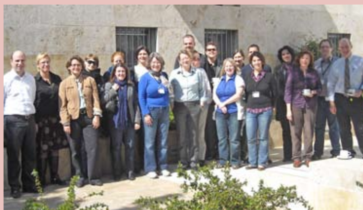
Participants in the Max Planck Institute for Demographic Workshop.