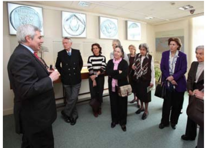
The Philoi at the ALPHA Bank Numismatic collection.

In March the Philoi visited the archaeological sites of Olympia, Ancient Messene, and the Temple of Apollo Epikourios as