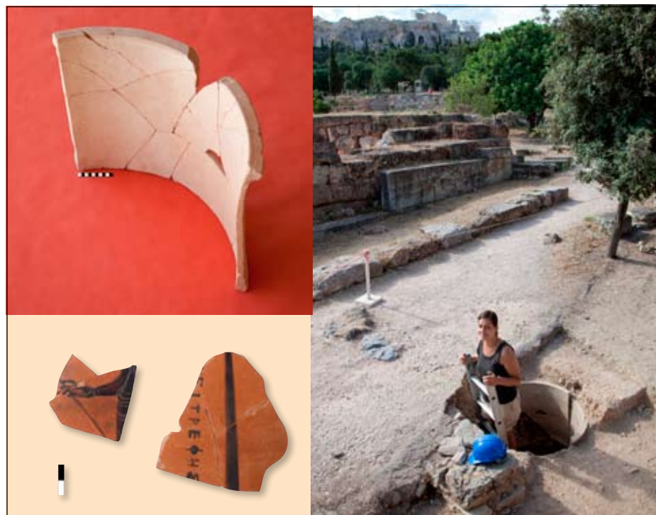
Photos, clockwise: A reconstructed terracotta well liner from the well. Three identical pieces would have formed a circle. Each ring (of three) would then be placed one on top of each other to line the well. Laura Gawlinski descending into the well in Section Γ to complete final measurements. Fragments of a Panathenaic amphora.

Section beta theta, overlying the building identified as the Stoa Poikile, was excavated at its eastern and western ends. At the west, we encountered the bottoms of foundations of early modern buildings. Remains of several equines were found, the bones largely disarticulated, as well as a large, shallow lime slaking pit; they seem to date to the sixteenth century, when this area was just