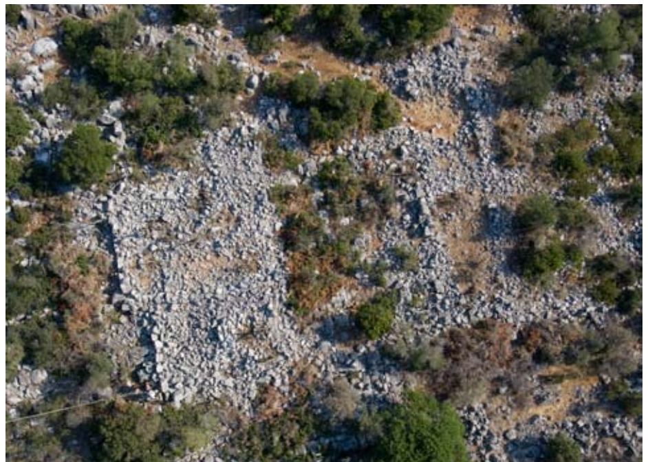
Balloon photo of Kalamianos Buildings 4-VI and 4-IX.