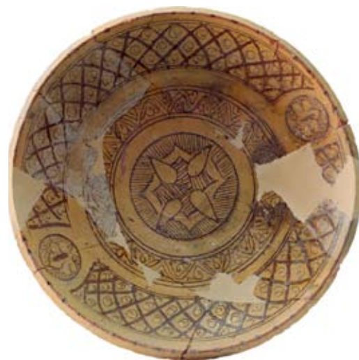
Late 12 th to early 13 th century bowl from early excavations

An application is being prepared to consolidate the walls of the house with appropriate koniama , to place geophasma, and to backfill the house to its original floor level. The house will then remain as an example of a Byzantine house at Corinth.