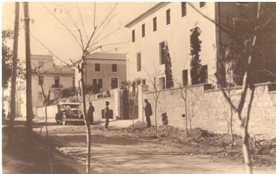
Loring Hall in 1929, before it officially opened.