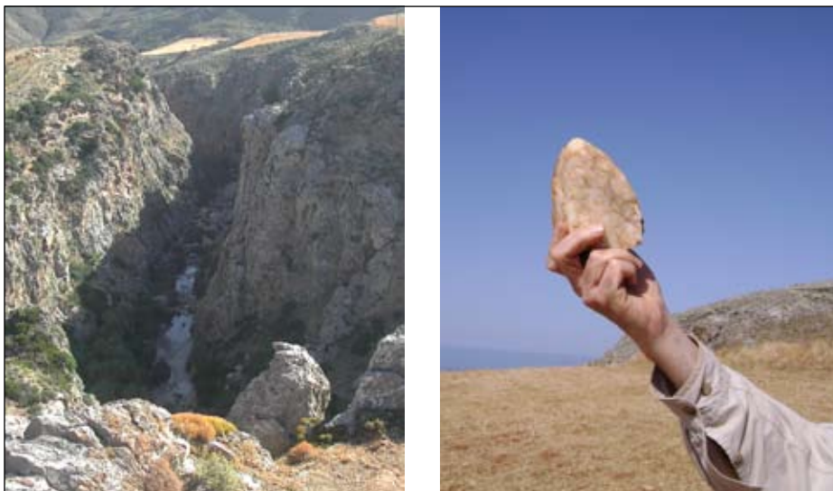
Plakias survey, left: the Preveli Gorge. Right: Hand axe found at its west flank.

Indeed, although the development of ritual centers and their relationship to earlier Mycenaean sites are subjects discussed individually at other sites, it has been until now difficult or impossible to bring Nemea into these dialogues, despite its being able to exhibit evidence for both issues. We hope that this project will make a significant contribution to our knowledge of Aegean prehistory, Iron Age regional transition, and studies of the development of organized ritual spaces. ❀