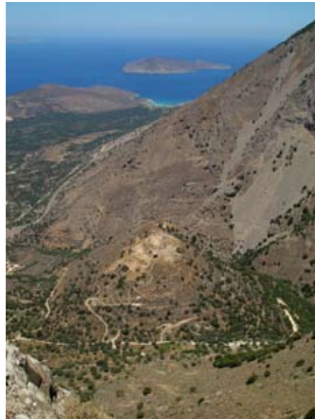
Aerial view of Azoria from the southwest.

The Archaic houses at Azoria were also built in the early sixth century, demonstrating a static construction of social space, remaining visibly unchanged until the site's abandonment and destruction in the early fifth century. Study in 2009 is now showing that the types of food processing equipment, and the distribution and condition of grain and other produce in the houses, point to the decentralization of storage and primary processing. We have begun to visualize the households in the city center as principally consumers; their assemblages reflect final stage processing and consumption—and storage as