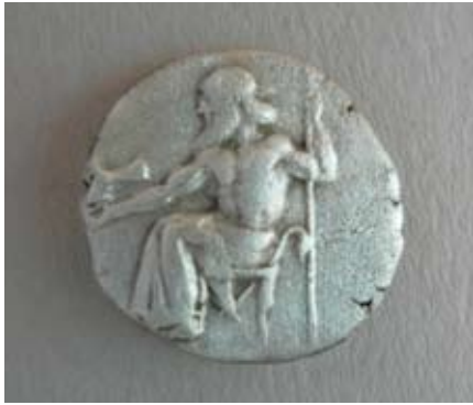
Silver Stater, Arcadian League, Zeus Lykaeos, fifth century B.C.