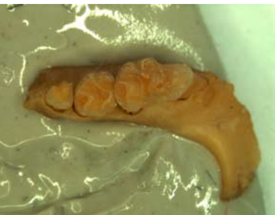
Mus domesticus maxilla, House C.3, LMI, Room 2.3.

Excavations on the island of Mochlos and the opposite coastline of Crete began in 1989 and have so far uncovered Byzantine, Hellenistic, Mycenaean, and Minoan occupational phases. With such a variety of contexts a microfaunal analysis can be interesting and, perhaps, surprising. The material I examined was collected during these excavations. The majority of the samples under examination belong to the Late Minoan I (both A and B) period and are derived from island houses C.1–C.8 and Plateia B south of House C.2, whereas the Middle Minoan III or transitional Middle Minoan IIIB/Late Minoan IA is represented by very few samples from the same houses. The material will be published in one of the forthcoming Mochlos volumes and will also be incorporated in my doctoral dissertation.