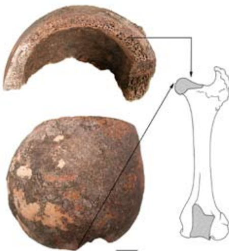
Spherical bowl from head of femur.