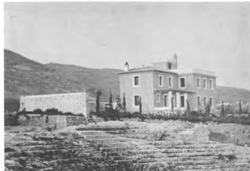
a. Corinth, Horace S. Oakley House, 1927-1970, as it appeared in 1930