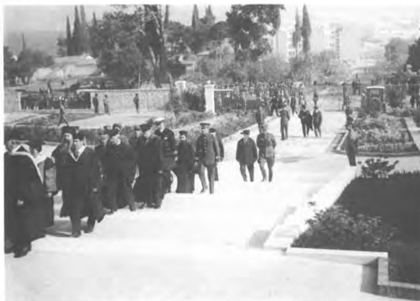
a. Procession of dignitaries at the dedication of the Gennadeion April 23, 1926