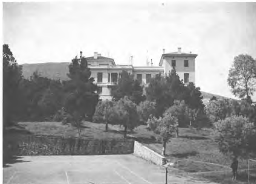
a. The School Building after addition of the East Wing 1913-1914, south side