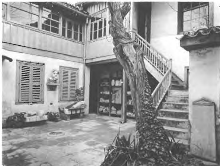
a. Athenian Agora, Old Excavation House and Museum 1931–1956