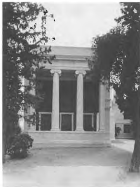
b. Arthur Vining Davis Library Wing of the Main Building 1959, north façade