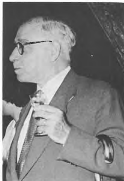
b. Aristides Kyriakides 1942–1967