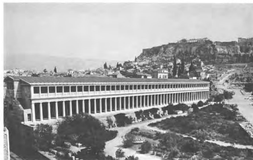
a. Stoa of Attalos, exterior 1956