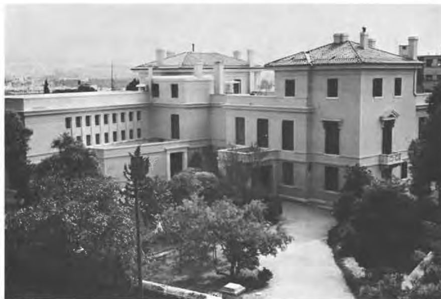
b. The School Building with the Arthur Vining Davis Library Wing, 1959, north side