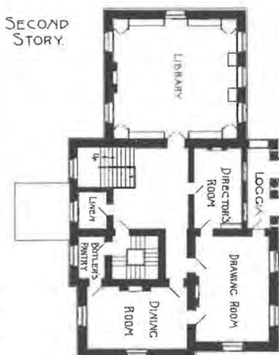
Elevation and plans of the original School Building 1887-1888