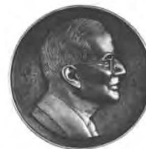
b. John D. Rockefeller, Jr., benefactor of the Athenian Agora