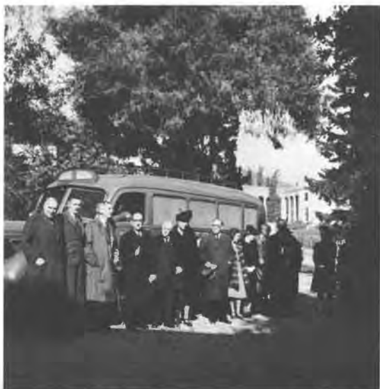
a. American School Ambulance IASO presented to the Greek Red Cross, January 5, 1941