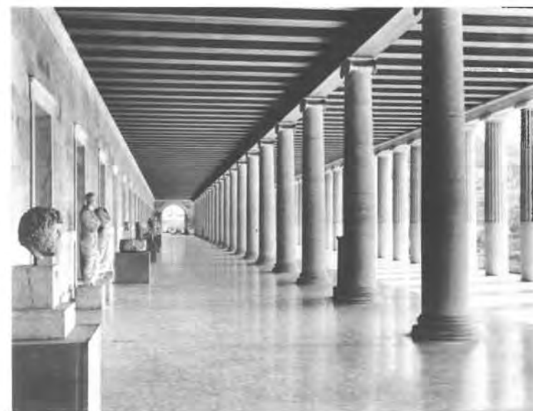
b. Stoa of Attalos, lower colonnade