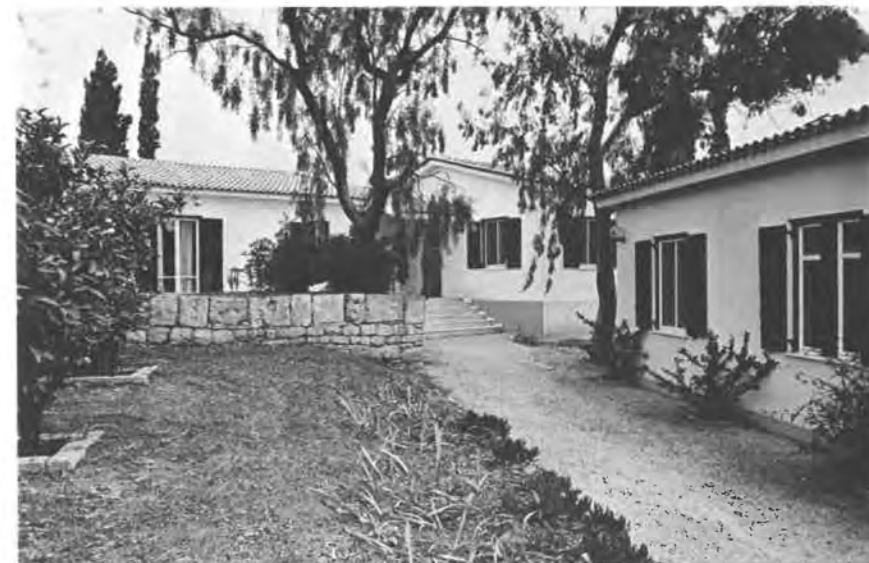
b. Corinth, Henry Schroder Robinson and Rufus B. Richardson Houses 1975 and Bert Hodge Hill House 1972