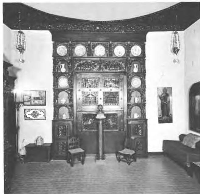
b. Gennadeion West Wing, Stathatos Room 1972