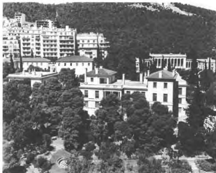
a. The School Buildings in 1966, from the south: Loring Hall, center left; Main Building, center; Gennadeion, upper right