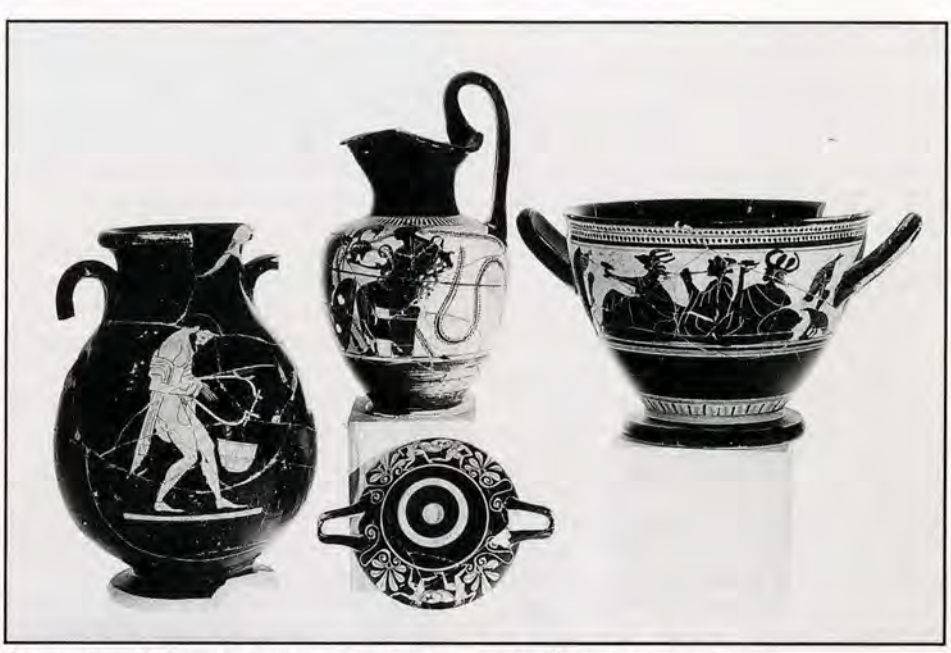
Pottery from Persian level destruction in Agora well.

By 1995 the number of named Fellowships for the School's first year students has risen to four, while the number of advanced Fellowships funded by School endowment now totals as many as six.