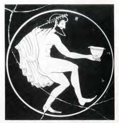
Detail from red-figured cup found in Late Archaic well.

deposited in the second quarter of the 5th century. This deep fill seems to represent a major rearrangement following the Persian sack of Athens in 479 B.C. The fill contained several bronze arrowheads, a few broken bits of early architecture, and signs of burning.