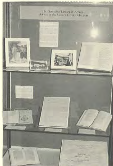
Portion of exhibition, "The Gennadius Library in Athens: a View of the Modern Greek Collection", at Princeton University's Firestone Library in November during the Annual Meeting of the Modern Greek Studies Association.

The Library, in conjunction with the Committee on Hellenic Studies at Princeton University, mounted a loan exhibition of materials from the Gennadeion at Princeton's Firestone Library in