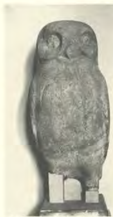
Archaic owl, Akropolis Museum No. 1974.