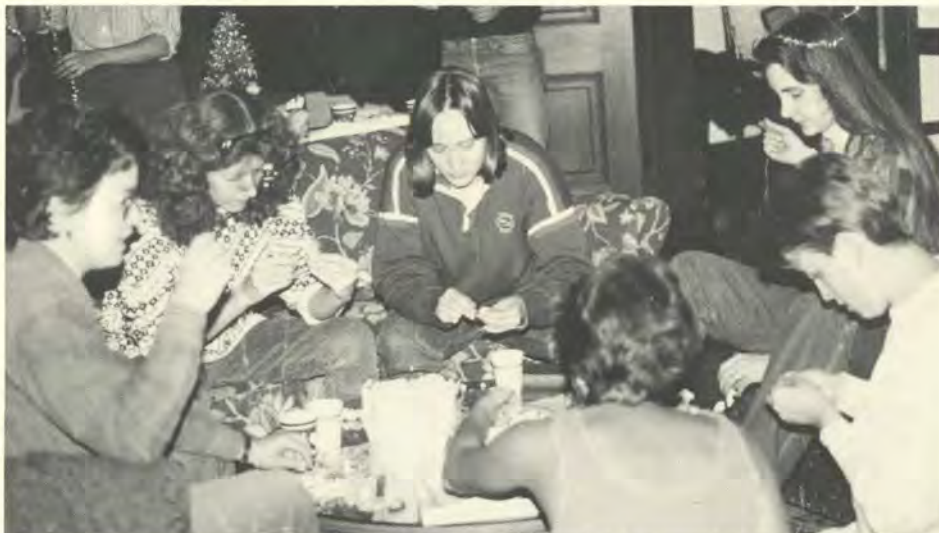
Students at the School worked long and hard to string popcorn for the annual Christmas party at the Director's residence, held on December 10.