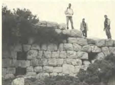
School members discover Temple of Athena Kranaia.

High in the hills overlooking the rich plain of the Upper Kephissos valley sits the Temple of Athena Kranaia. It is not visited by many people other than the local farmers and shepherds; nor is it a stop on the School's regular trip through