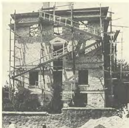
The 1913-1915 addition to the Main Building, under construction.