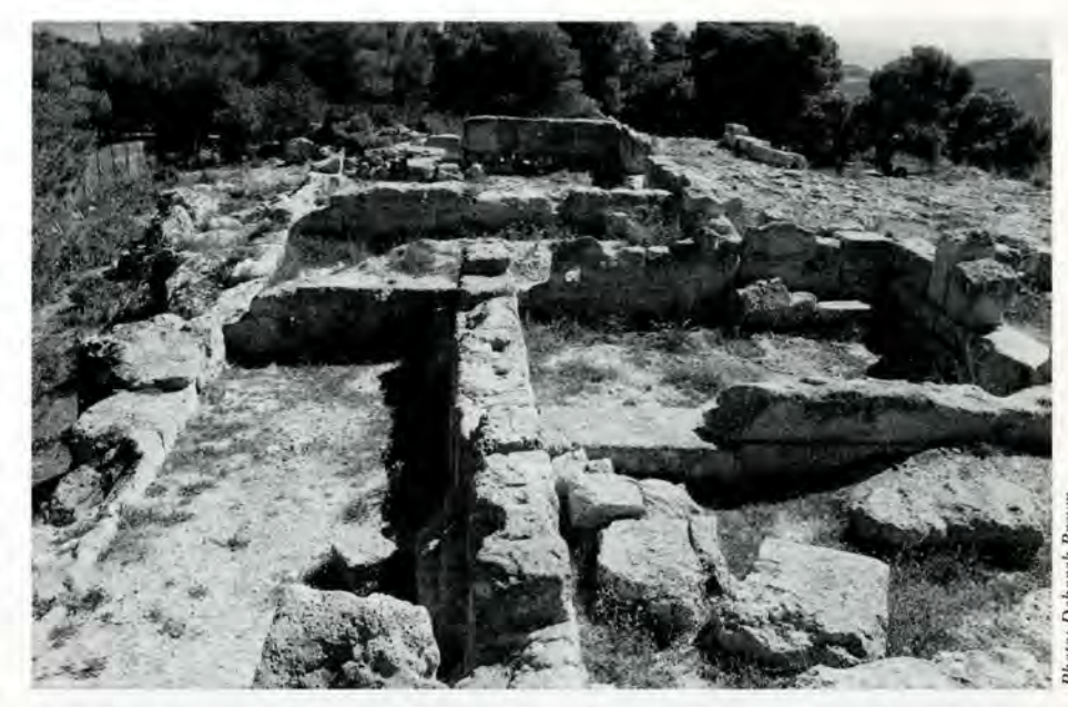
The walls and courtyard of the complex known as "Die Sudösthäuser," outside the terrace walls of the Temple of Aphaia on Aigina, could be the remains of a priest's house.

Nevertheless, from descriptions in texts and from archaeological examples that are identified on the basis of texts, we can identify some characteristics of sacerdotal houses. Although the amount of time and the circumstances in which personnel resided at sanctuaries varied considerably, the