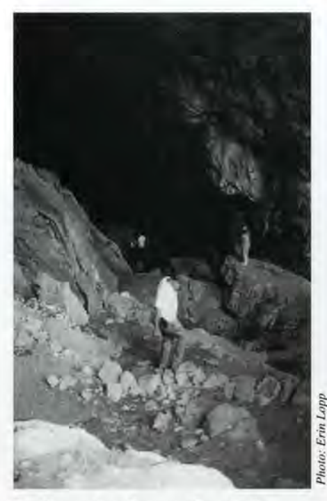
The descent into Kamares Cave leads explorers to the ritual areas within.

After the fall of the palaces, and under increasing Mycenaean influence and population, major changes occurred in the choice of sacred caves. Although many cave sanc-