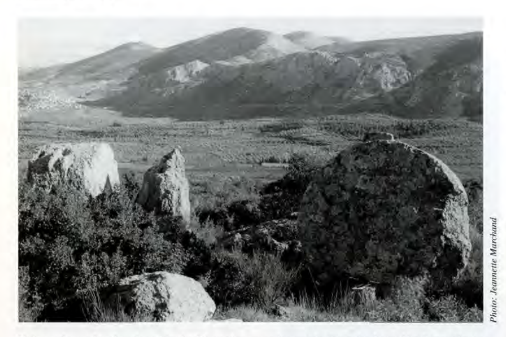
Column drums lie abandoned in the Kleonaian quarries overlooking the Agios Vasilios valley in the northeastern Peloponnesos.