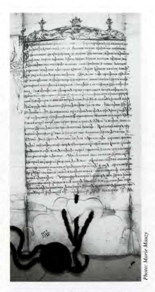
A Russian imperial charter granted the monks of the Monastery of the Genesis of Mary, Mother of Jesus on the island of Melos permission to collect money in Russia for the monastery's support.

The Russian collection of the Patmos archive comprises about twenty documents of the post-Byzantine period, when the Russian tsar (together with the princes of the Romanian countries and some Georgian rulers) was one of the principal protectors of the Orthodox tradition in the lands that belonged to the Ottoman Empire. Among