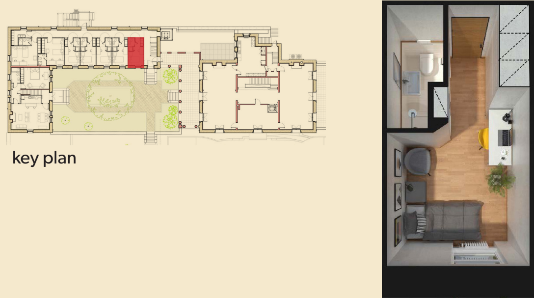
First floor Annex Single room with bathroom