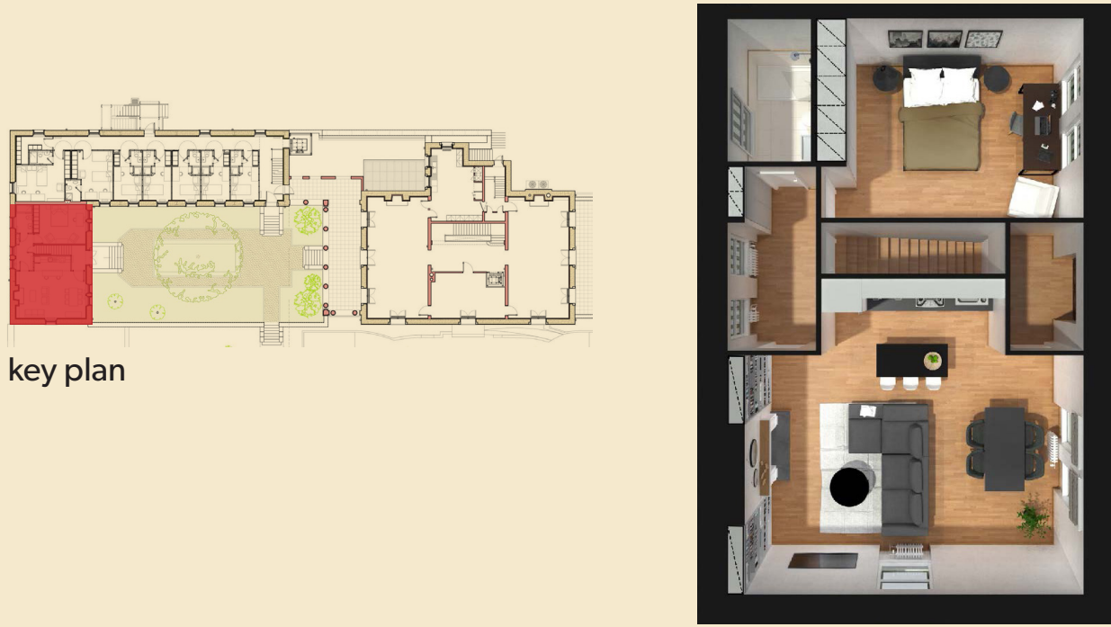
First floor West House Apartment