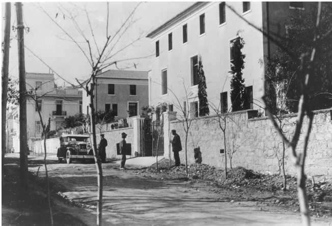
The Student Center Complex in 1929